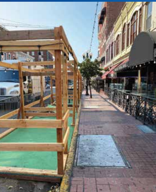
Do not block access to SDG&E structures with objects or other barriers.