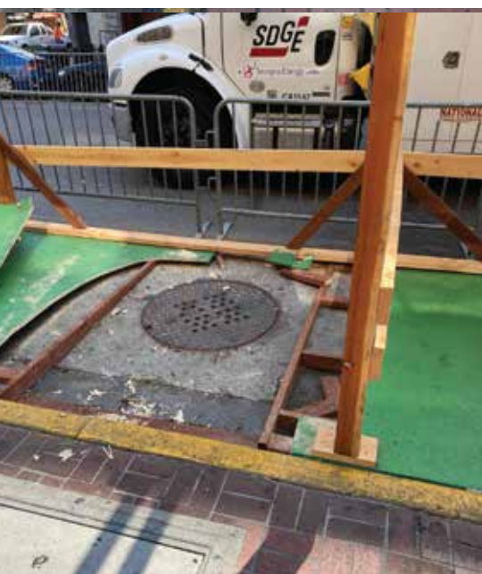
Maintain 24-hour access to all utility equipment in the event of emergencies and essential maintenance.