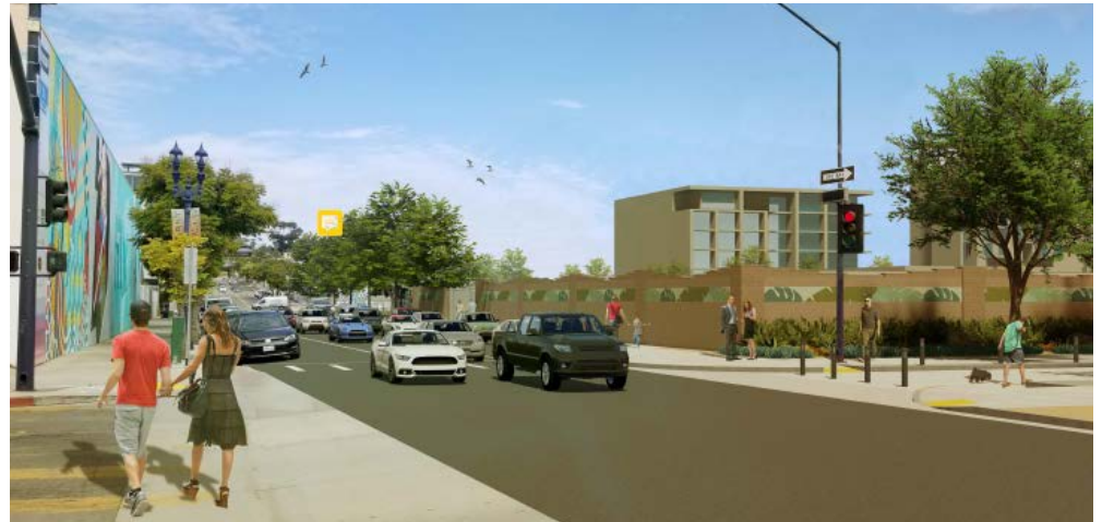
This graphic serves as an illustration to depict the anticipated appearance of the finished substation

Our commitment to providing safe and reliable energy means making improvements to our system, which includes rebuilding and upgrading the existing Urban Substation. This project will replace aging electric service equipment and improve the safety and reliability of electric transmission and distribution systems for the downtown San Diego area.