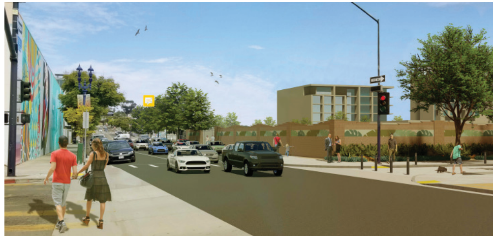
This graphic serves as an illustration to depict the anticipated appearance of the finished substation

Our commitment to providing safe and reliable energy means making improvements to our system, which includes rebuilding and upgrading the existing Urban Substation. This project will replace aging electric service equipment and improve the safety and reliability of electric transmission and distribution systems for the downtown San Diego area.