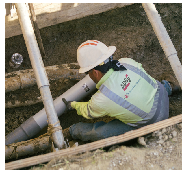
Julian Undergrounding Project

The Strategic Undergrounding Program will provide heightened wildfire resiliency and electric reliability by undergrounding distribution lines near key community facilities.