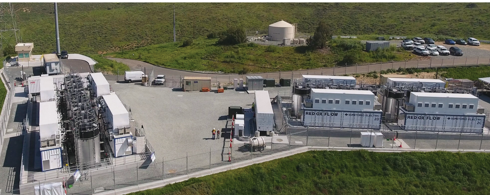
SDG&E's vanadium redox flow battery (2MW/8MWh) located in south San Diego County was the first battery of its kind to be connected to the CAISO market.