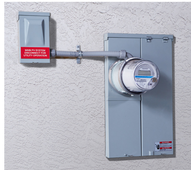
The Renewable Meter Adapter may save customers time and money.