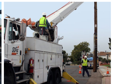
Partial, temporary street closures will be needed when crews remove poles.