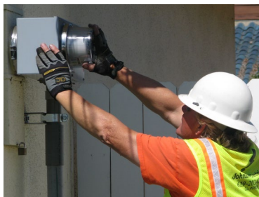
Crews will need to access meter service panels so they are ready for new underground service.