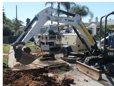
Trenching in both public streets and private property is a necessary part of the undergrounding process.