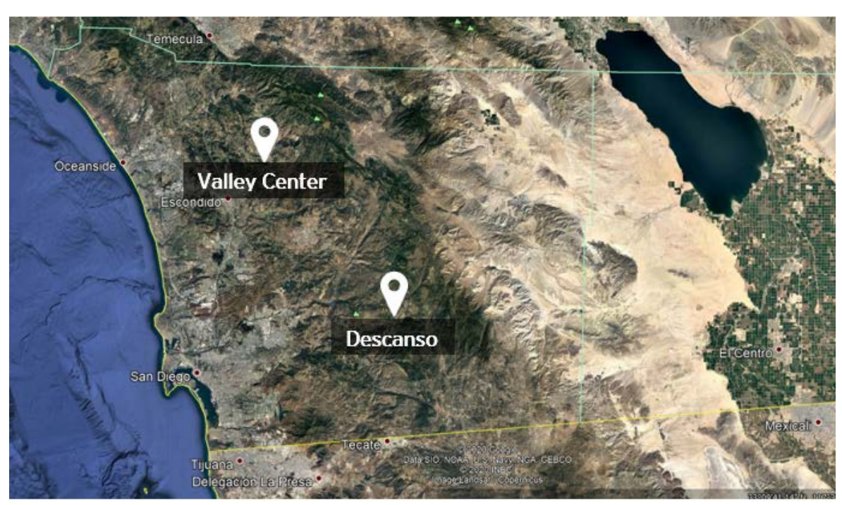
Approximate locations of SDG&E PSPS outages, Sept. 8–9, 2020

The PSPS in Valley Center impacted circuit device 1030-987 for 3 hours and 24 minutes. The outage on device 1030-987 began on Wednesday, Sept. 9, 2020 at 04:10, and was restored on Wednesday, Sept. 9 at 07:34.