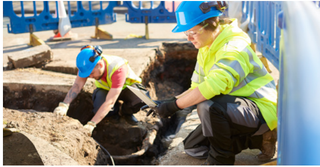
For more information, please visit our Builder Services Resource Center at sdge.com/builder-services .