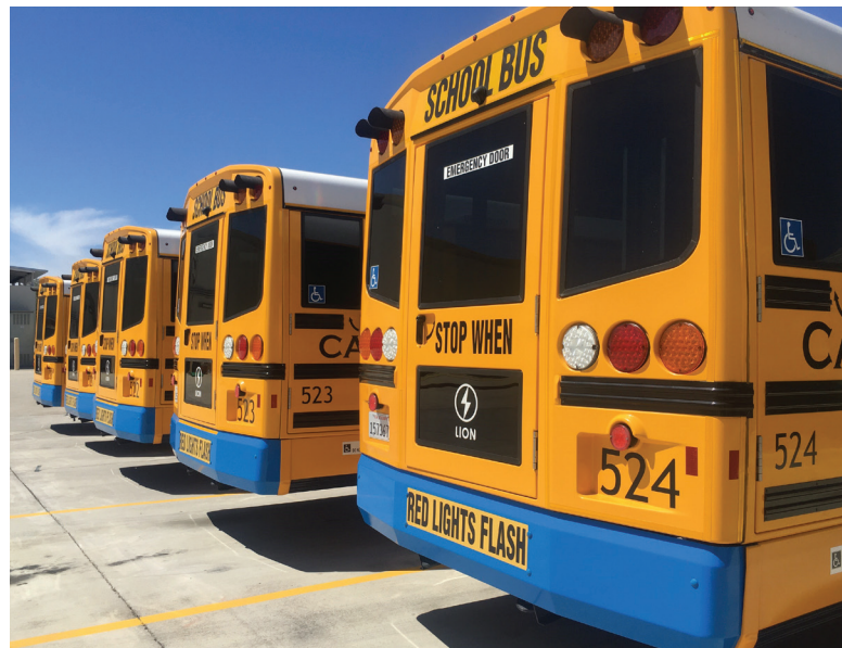
SDG&E is piloting vehicle-to-grid (V2G) technology with electric school buses at the Cajon Valley Union School District.

When: In March, SDG&E energized the first EV chargers built under Power Your Drive for Fleets. Expect to complete the program by end of 2026.