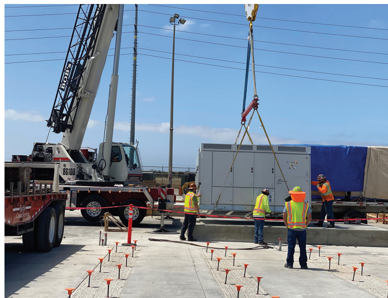
Construction of the Top Gun Energy Storage facility, which is expected to be operational in June 2021.

Where: The existing Palomar Energy Center in the City of