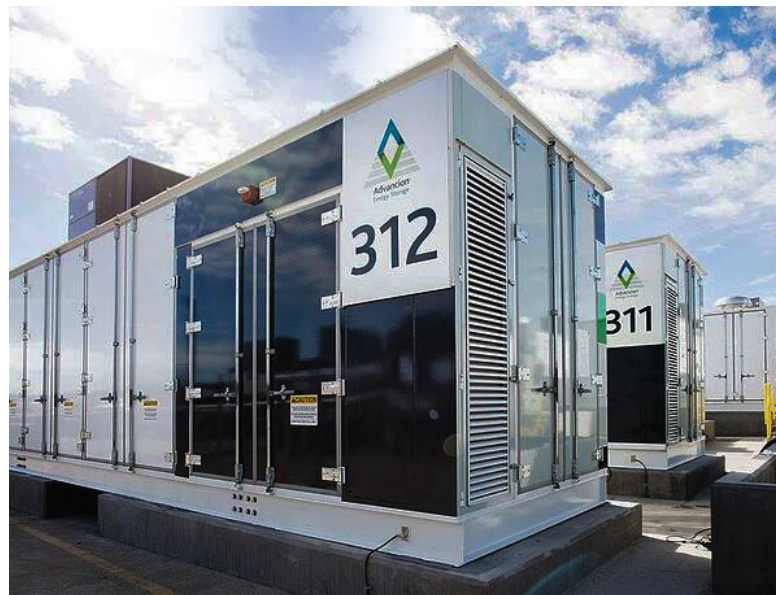
In 2017, SDG&E built what was then the largest lithium-ion battery (30MW/120MWh) in the City of Escondido.

When: Groundbreaking is imminent and completion expected in late 2021 / early 2022.