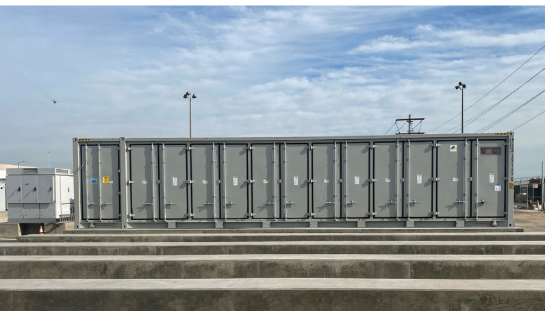
Top Gun Energy Storage is so named because it is located near Marine Corps Air Station Miramar, former home of the Top Gun naval aviation training program.

Where: Existing Miramar Energy Facility in the Miramar area of the City of San Diego