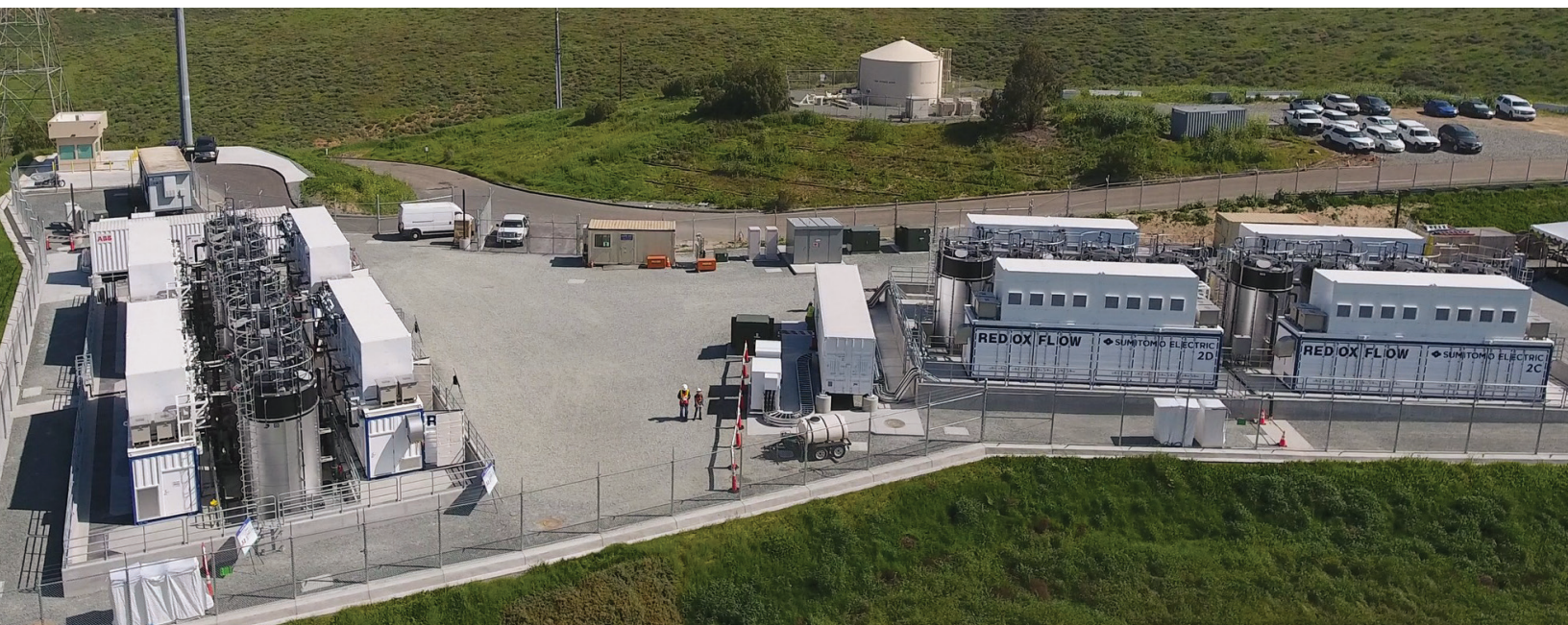
SDG&E's vanadium redox flow battery (2MW/8MWh) located in south San Diego County was the first battery of its kind to be connected to the CAISO market.