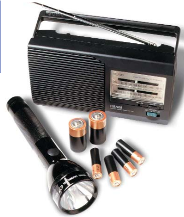
Un kit de seguridad para casos de apagones debe incluir linternas, baterías nuevas y un radio portátil de baterías.